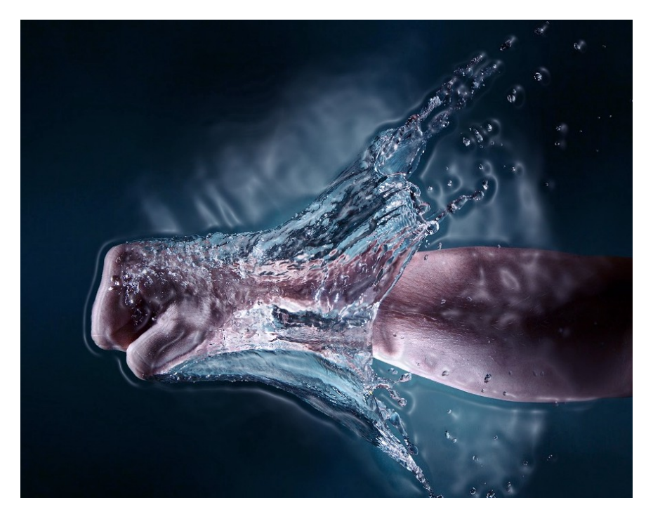
It's the punch you don't see coming that knocks you down.

"True humility is not thinking less of yourself, but thinking of yourself less."—C.S. Lewis